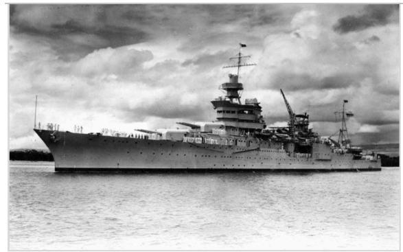
USS Indianapolis in Pearl Harbor, Hawaii in 1937.

USS Indianapolis (CL/CA-35) was a Portland-class heavy cruiser of the United States Navy, named for the city of Indianapolis, Indiana. Launched in 1931, the vessel served as the flagship for the commander of Scouting Force 1 for eight years, then as flagship for Admiral Raymond Spruance in 1943 and 1944 while he commanded the Fifth Fleet in battles across the Central Pacific during World War II. In July 1945, Indianapolis completed a top-secret high-speed trip to deliver parts of Little Boy, the first nuclear weapon ever used in combat, to the United States Army Air Force Base on the island of Tinian, and subsequently departed for the Philippines on training duty. At 0015 on 30 July, the ship was torpedoed by the Imperial Japanese Navy submarine I-58, and sank in 12 minutes. Of 1,195 crewmen aboard, approximately 300 went down with the ship.[4] The remaining 890 faced exposure, dehydration, saltwater poisoning, and shark attacks while stranded in the open ocean with few lifeboats and almost no food or water. The Navy only learned of the sinking four days later, when survivors were spotted by the crew of a PV-1 Ventura on routine patrol. Only 316 survived.[4] The sinking of Indianapolis resulted in the greatest single loss of life at sea from a single ship in the history of the US Navy.[a]